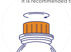
Step 1: Open the cap

It is recommended that Cavalor LaminAid be administered by syringe directly into the mouth.